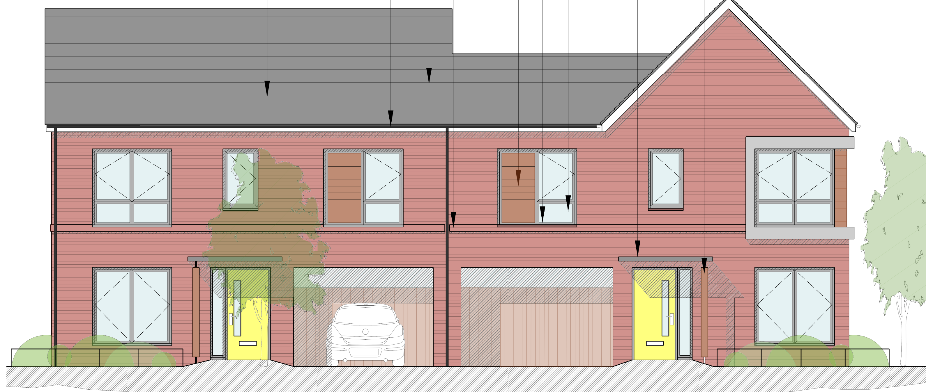
Elevation AA (1:50)

Corbelled Brick Courses (2 Courses) Stopped Around Downpipe PV Panels to South/West Elevations (Refer to Roof Plan) Black UPVC Gutters and Downpipes Flat Concrete Roof Tiles (Colour Grey) Timber Panel Within Frame Adjacent to Window Grey UPVC Windows Opaque Glazed Panels At Low Level Single Ply Membrane Roof Finish to Porch Circular Section Timber Support Post to Porch