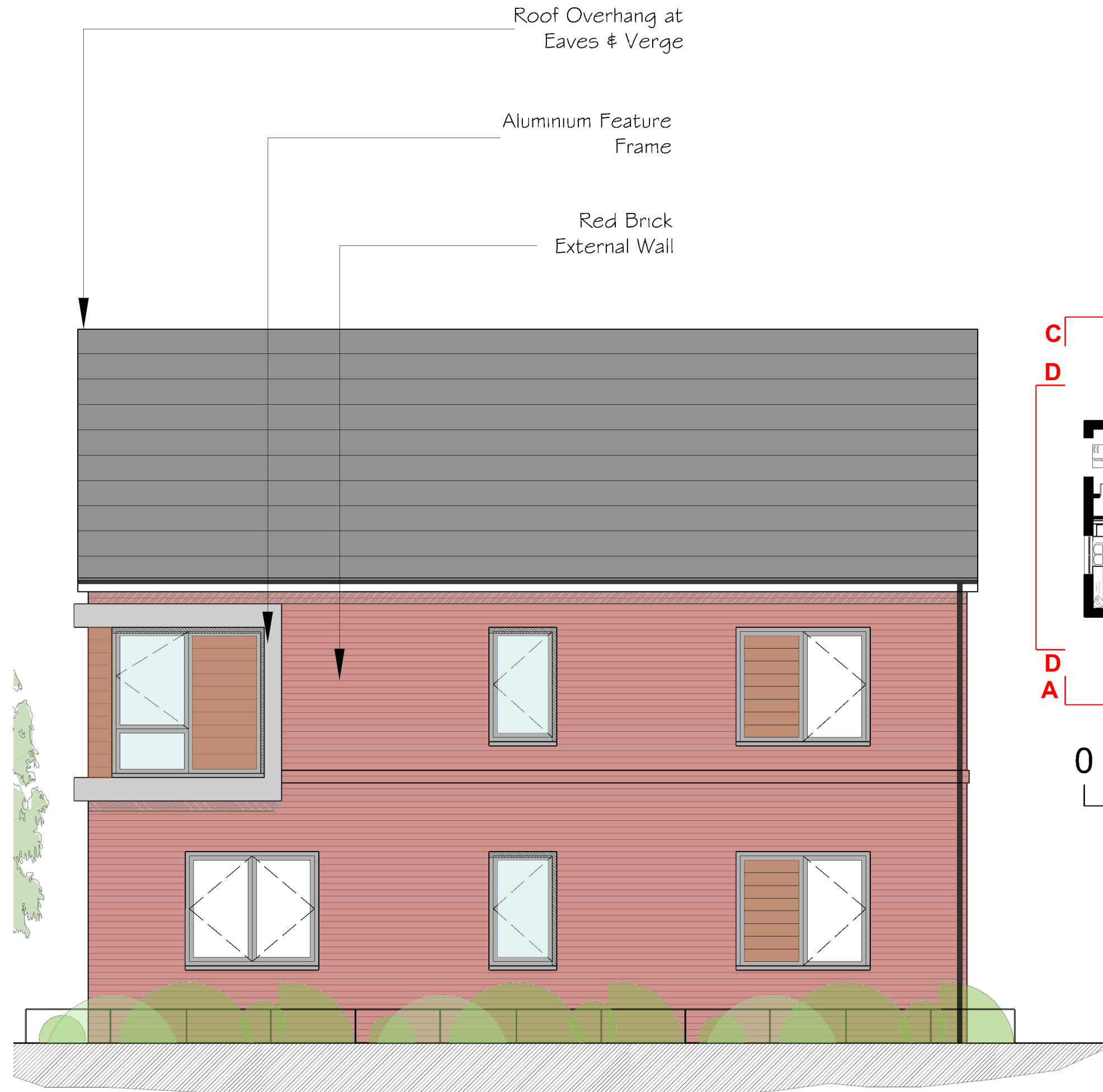
Elevation BB (1:50)