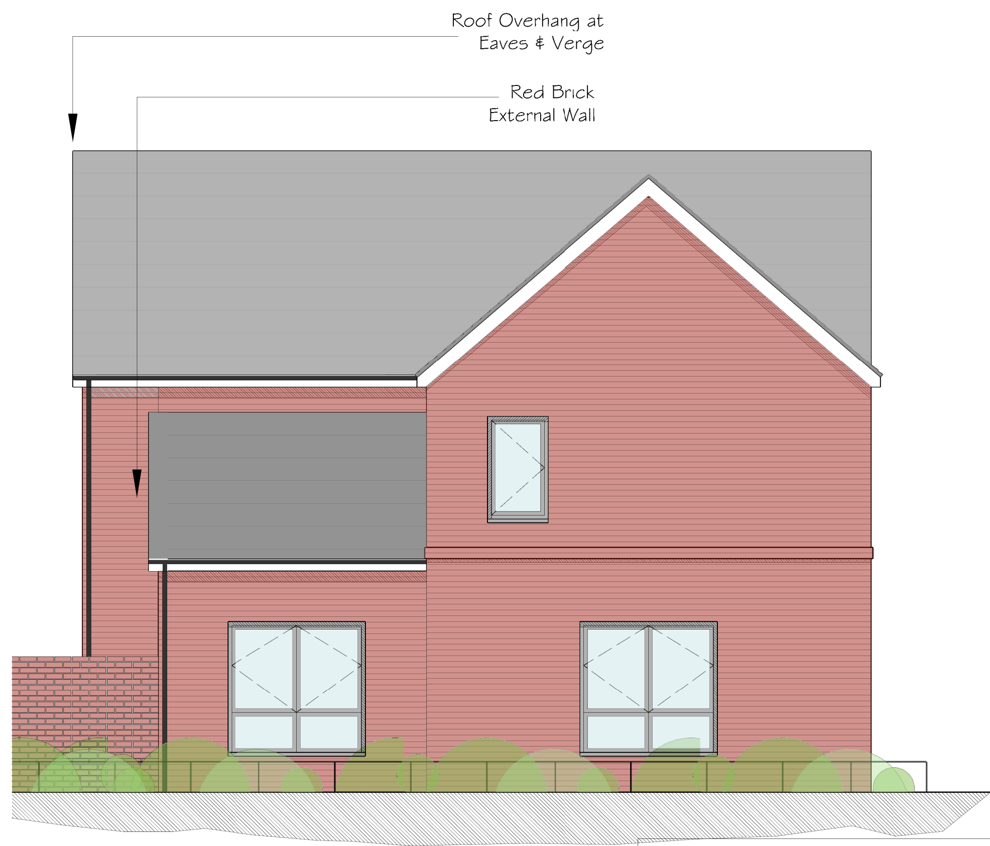
Elevation DD (1:50)